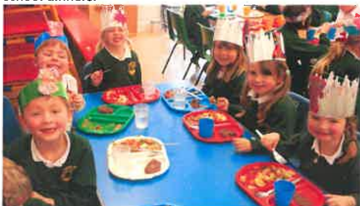
We all wore our hats and enjoyed our food!

So bring us some figgy pudding! The school hall was packed as all the staff joined in the fun to serve 93 cooked school dinners.